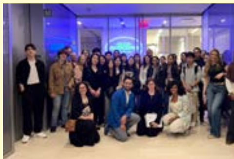
Teen Writing Prize winners during their visit to Hearst Tower.