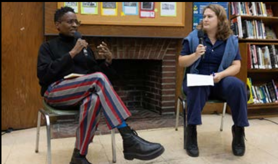
National Book Award winner Jacqueline Woodson was featured at an author talk held at Brownsville Library.

In partnership with the Brooklyn Institute for Social Research, BPL also presents Sips & Scholars, a free lecture series set in bars and restaurants across Brooklyn. This unique program brings thought-provoking discussions into relaxed, social settings.