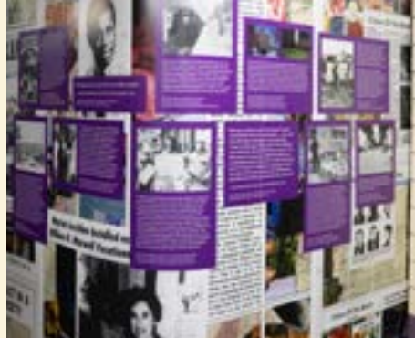
A closeup of the Memories Matter installation at Euclid Avenue Subway Station.