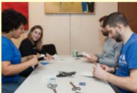
Hearst Corporation volunteers assembling activity kits for teen patrons.