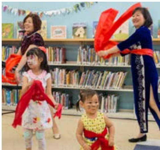
Bay Ridge Library's Culture Fest event had local families on their feet.

The enduring partnership exemplifies how local institutions can work together to bridge cultures, promote literacy and empower communities. In our ever-evolving borough, Apple Bank and BPL remain united in their mission to ensure that residents across backgrounds and languages feel welcome, heard and supported.