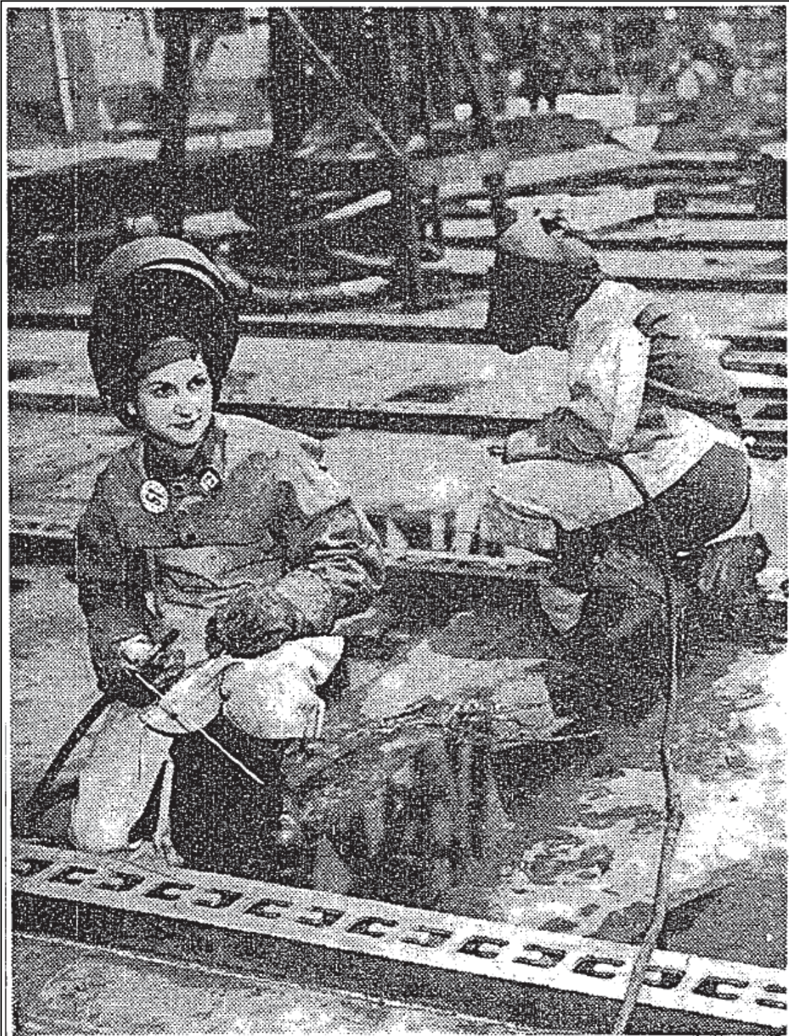
Two women welders working on the flight deck of a new Essex Class aircraft carrier at the New York Navy Yard.

Document 6 – “Women Help Build Carrier for Navy.” Brooklyn Daily Eagle .