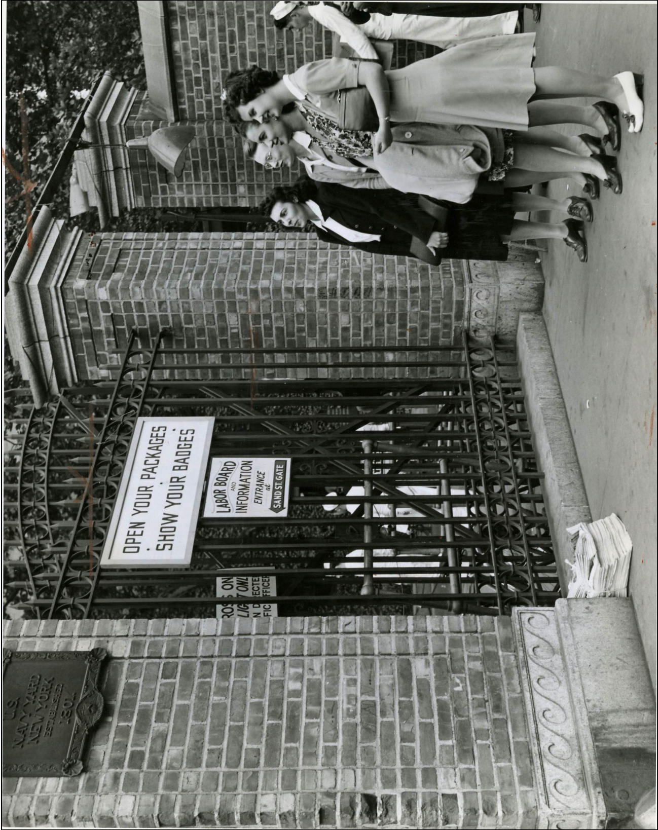
DOCUMENT 5: "First day of work for women at the Navy Yard." Brooklyn Daily Eagle. 14 Sept 1942.