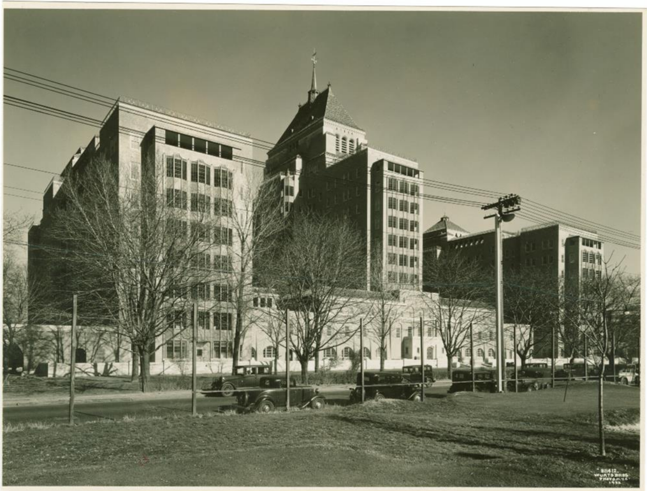
Document 4 – Kings County Hospital . 1965.

Kings County Hospital, or as it is now known as Kings County Hospital Center, has claimed many "firsts" in the field of medicine. Located on Clarkson Avenue between New York Avenue and Albany Avenue, "it was the site of the first open-heart surgery performed in New York State; Kings County physicians invented the world's first hemodialysis machine, conducted the first studies of HIV infection in women and produced the first human images using magnetic resonance imaging (MRI). In addition, Kings County was named the first Level 1 Trauma Center in the U.S." (NYC.gov)