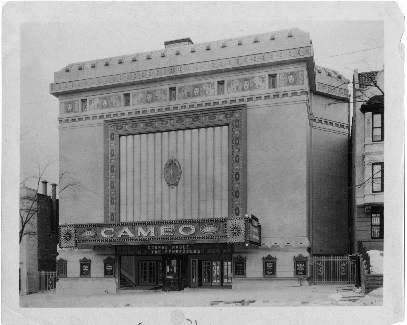
DOCUMENT 7a: Excelsior Commercial Photo Co. Cameo Theatre . 5 Jun 1944. Print. Brooklyn Collection, Brooklyn Public Library.