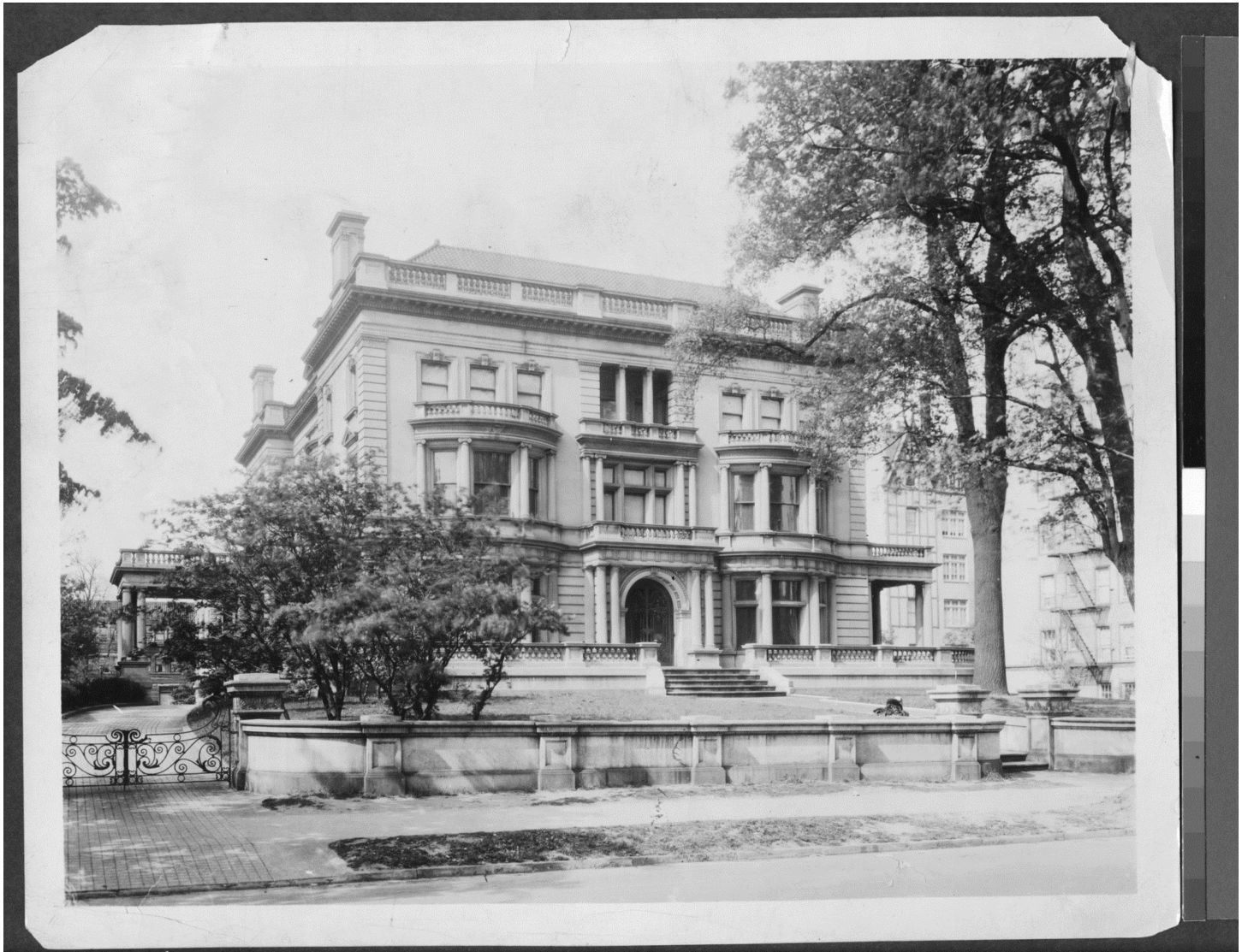
DOCUMENT 4: Seaman Mansion. 190-?.