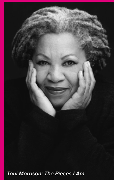
Toni Morrison: The Pieces I Am

A biannual series, Message from the Library convenes diverse voices in the Library's safe space to have meaningful dialogue about the most precarious issues of the day.