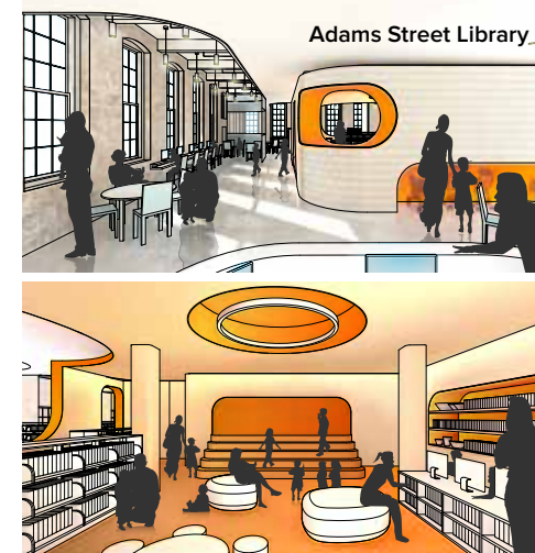
Rendering by WORKac

➔ To learn more about the Central Library project visit bklynlibrary.org/locations/central/renovation