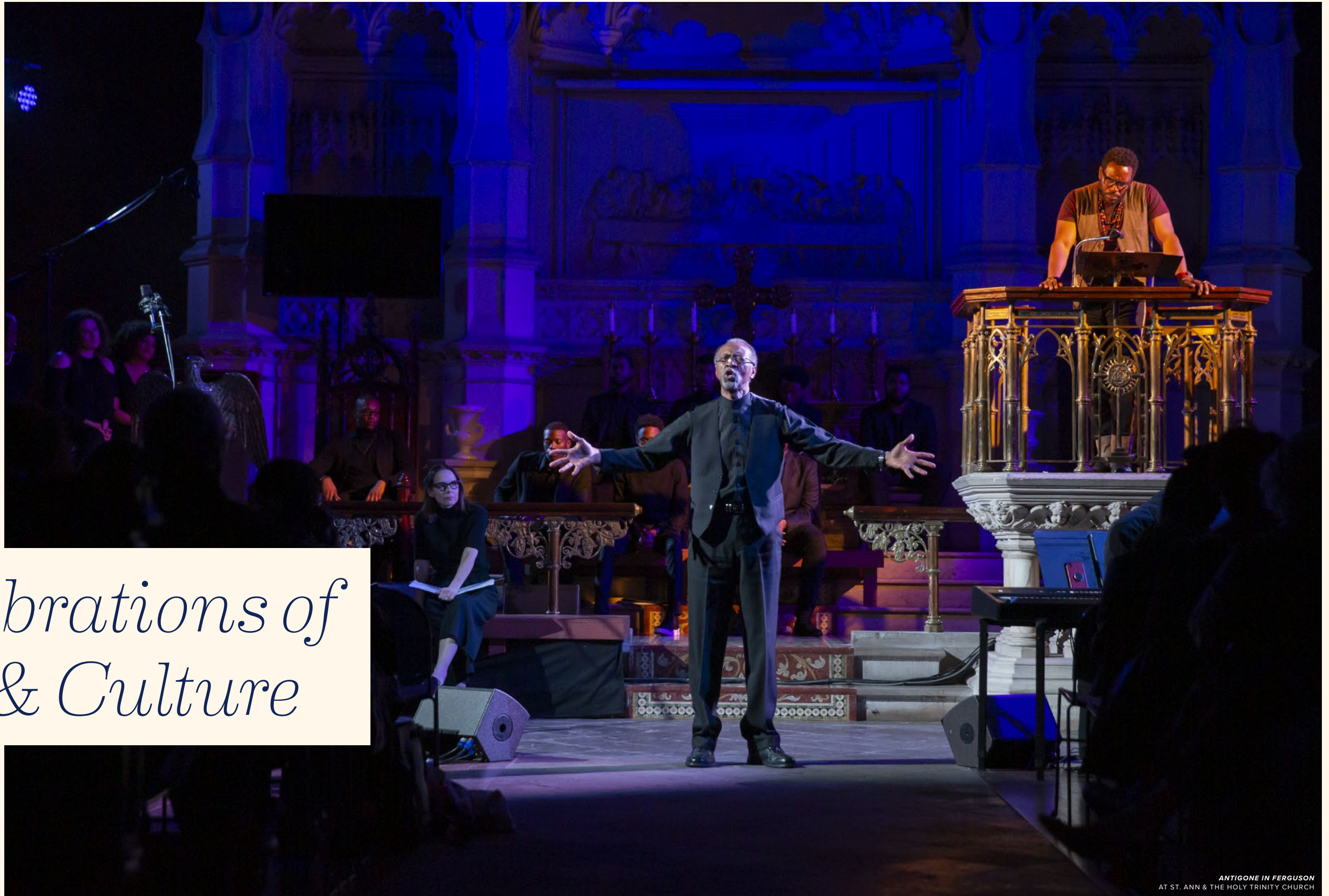
ANTIGONE IN FERGUSON AT ST. ANN & THE HOLY TRINITY CHURCH